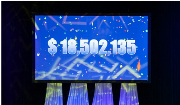
The Breakthrough T1D

Illinois Gala is recognized as the number one charity event in Chicago by Crain's Chicago Business. It brings over 2,000 philanthropists, community leaders, and corporate partners together for an unforgettable evening featuring an expansive silent auction, a one-of-a-kind live auction, a seated dinner, award-winning entertainment, and Breakthrough T1D's signature Fund A Cure program. The 2024 Gala raised a record-breaking $18.5 million, the highest-grossing fundraising event in Breakthrough T1D's national history.